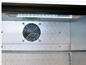
Inner LED light